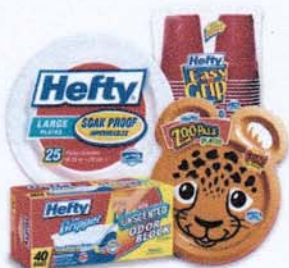
disposable tableware & waste bags