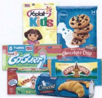
refrigerated & dairy