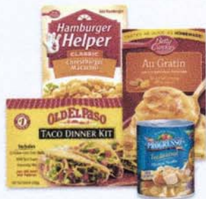
meals & sides