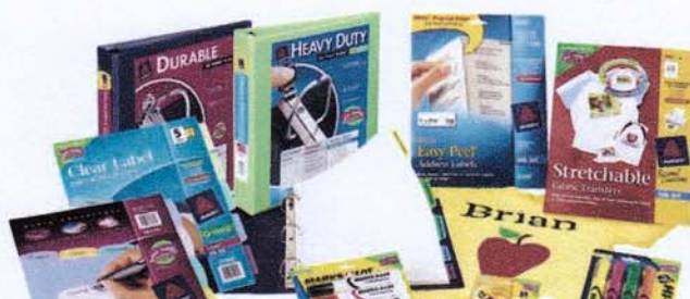
school & office supplies

Visit btfе.com/products for a complete list of participating Box Tops products