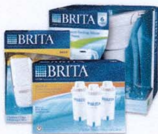
water filtration systems and filters