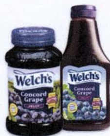
jams, jellies & spreads