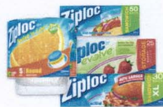
storage bags & containers