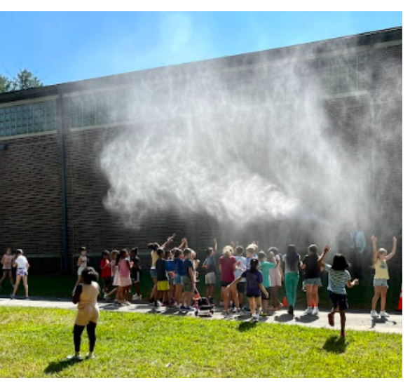
Lane students staying cool at recess!